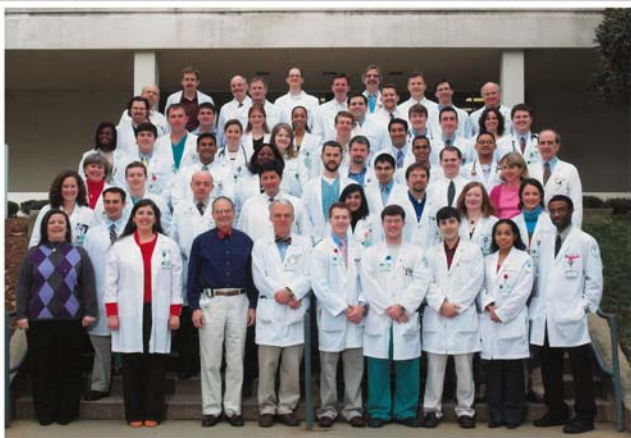
Department Photo 2005 - 2006