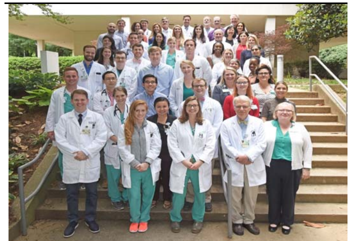
Department Photo 2017-2018