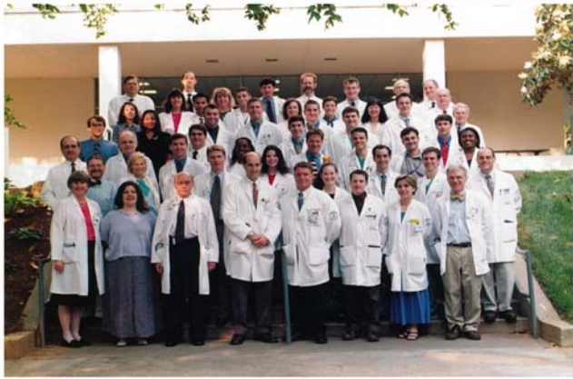
Department Photo 2000 - 2001