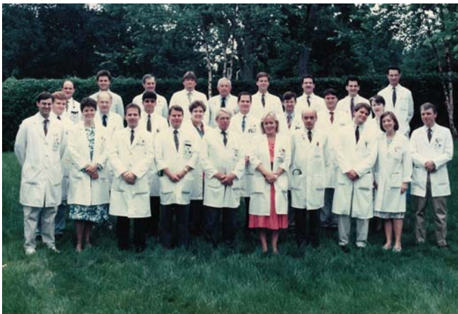
Department Photo 1996 - 1997