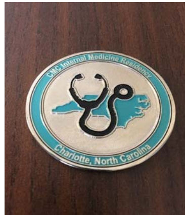
CMC Challenge Coin (Back)