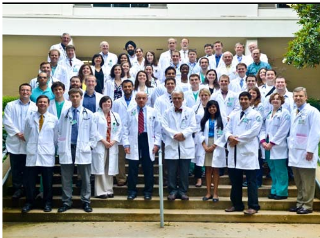
Department Photo 2011 - 2012