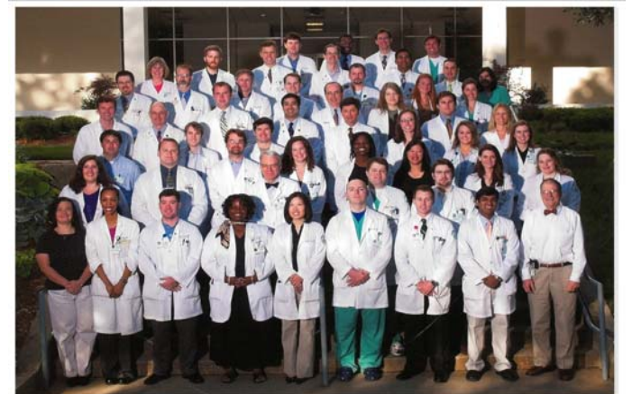
Department Photo 2006 - 2007