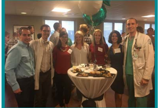
CMC Intern Welcome Reception