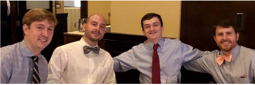
A few members from the CMC Internal Medicine Class of 2018 enjoying the graduation event

This past June, our department gathered at Maggiano's Little Italy restaurant in South Park to celebrate the accomplishments of our graduating residents. A new tradition was started at this year's event in that every graduate was presented a "challenge coin" designed specifically for the CMC Internal Medicine Residency Program.