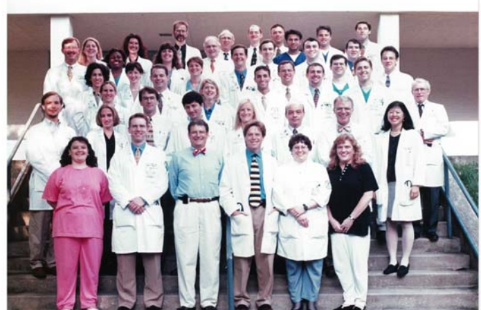
Department Photo 1998 - 1999