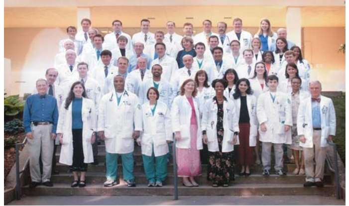
Department Photo 2003 - 2004