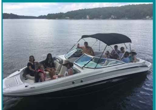
Intern Welcome Party at Lake Wylie