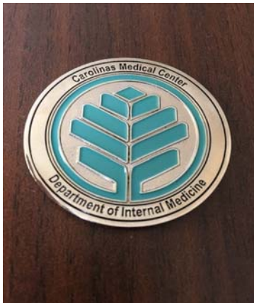
CMC Challenge Coin (Front)

In honor of this tradition, a special coin was designed specifically for the CMC Internal Medicine Residency program. Moving forward, a coin will be presented to each residency graduate in recognition of his/her achievement with the hope that the coin will serve as a physical reminder of the wonderful relationships formed at CMC.