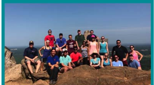
Intern hike to the top of Crowder's Mountain