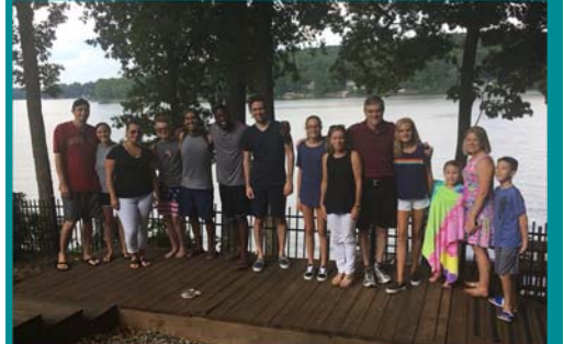
Intern Welcome Party at Lake Wylie