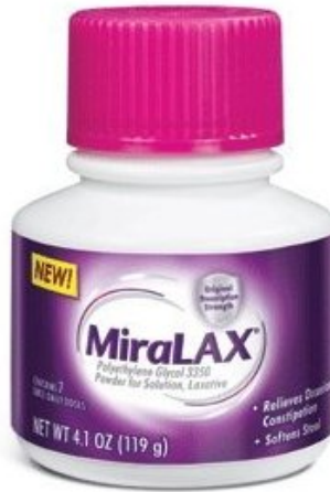
119g OTC - generic ok