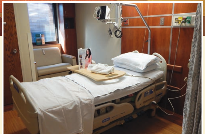
Renderings of the new entrance and rooms in the Women's Center at Scotland Memorial Hospital are shown at top and bottom, left. Bottom photo, right, is a newly renovated room on the second floor.

The first phase of renovations for Scotland Health Care System is underway. These multiple renovations are focused to improve patient flow and to provide a more excellent patient experience. The renovations are expected to cost about $2.5 million.