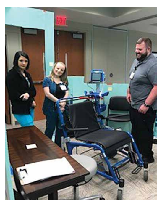
Staff members offered input during the mock-up phase at the W.R. Dulin Center

This renovation may start in late 2019 and is expected to take 10 to 12 months to complete.