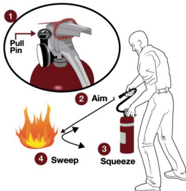
Figure 5. PASS

If you use a fire extinguisher on a small fire, remember to PASS