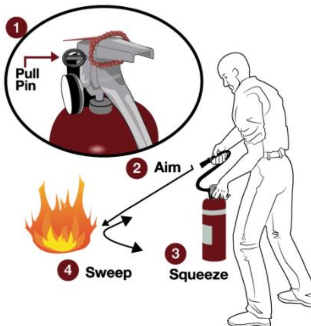
Figure 5. PASS

If you use a fire extinguisher on a small fire, remember to PASS