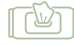
Wipes (90 per bundle)