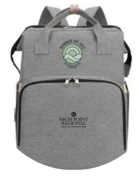
The Bundle of Joy package directly addresses many of the critical needs of both baby and mother in these vulnerable postpartum weeks, a period often referred to as the fourth trimester.