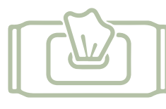
Wipes (90 per bundle)