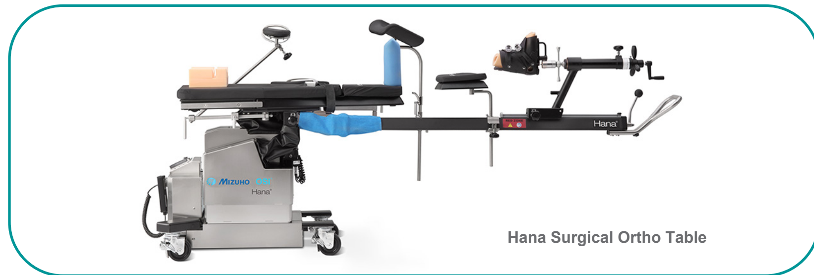
Hana Surgical Ortho Table