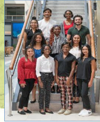
2022 EICS Participants

THE PROGRAM: Wake Forest University Graduate School of Arts and Sciences and Wake Forest University School of Medicine in Winston-Salem, North Carolina will host a summer research program to increase diversity in health-related research. The program focuses on research training in the cardiovascular sciences with medical school faculty. The curriculum includes biomedical laboratory research, a lecture series that features presentations by faculty and guest speakers, and a research symposium at which the students present their research findings. Undergraduate students with an interest in a career in biomedical research are encouraged to apply.