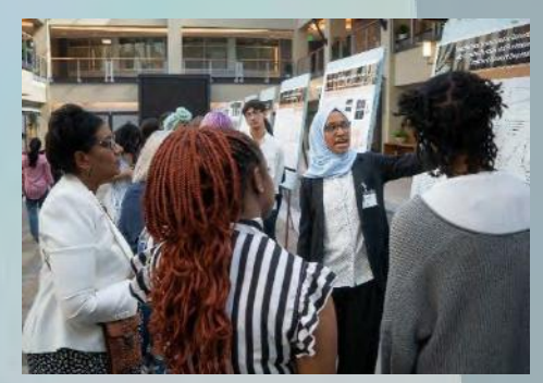
2022 Poster Presentation