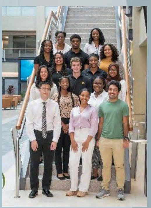
2022 Students and Program Directors