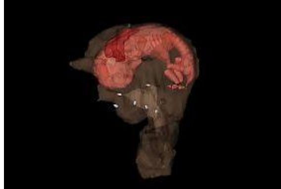
Scientists Prove Bioengineered Uteri Support Pregnancy