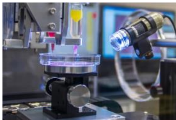
Wake Forest Researchers Bioprint Skeletal Muscle Constructs With Neural Cell Integration