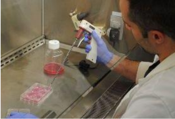
WFIRM's organoid technology to test drugs for COVID featured by NYT