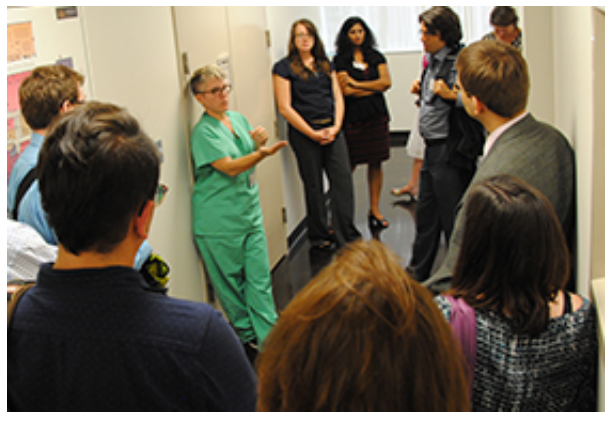
Regenerative Medicine Course Provided a Comprehensive Look at the Field

Fellowship Allows Researcher to Focus on Bladder Dysfunction