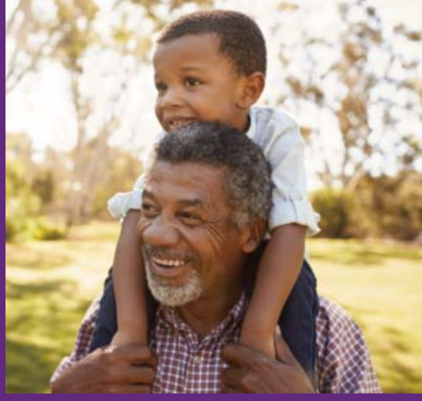
U.S. POINTER is a two-year study that will test whether changing to one of two different healthy lifestyle programs can protect memory and thinking.

For more information, contact us at: pointerstudy@wakehealth.edu