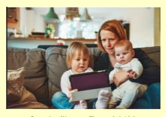
Speak with your Financial Aid Officer if you need additional loans for childcare costs.

Cost of attendance includes only the expenses associated with the student. A dependent care allowance, which most often means the cost of day care for dependent children, may be added to increase the cost of attendance. The amount allowed for day care is based on the ages of the children and on reasonable costs in the area. Keep in mind that the dependent care allowance results in borrowing more money. Students with these circumstances should discuss them with their Financial Aid Officer early in the admission process. Other sources of dependent support that should be explored include social services, religious organizations, and financial assistance from parents or other relatives. Students and spouses/domestic partners should review their lifestyle expectations and be in agreement before making the financial commitment to attend school. Each person needs to be prepared to live like a student, which often means giving up "extras" that before were taken for granted. Begin planning early to reduce debts, and start saving in anticipation of relocation expenses and salary reductions.