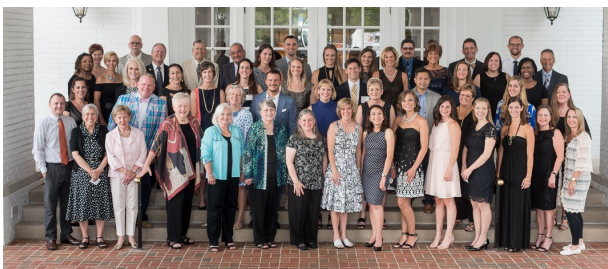
Over 100 alumni reunited for the 75th anniversary celebration.