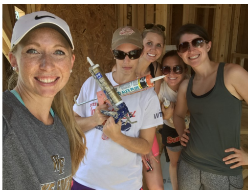
Students engaging in service activities, here while participating in a Habitat For Humanity build.