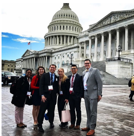
Students at the national capitol, during the AANA mid-year assembly.