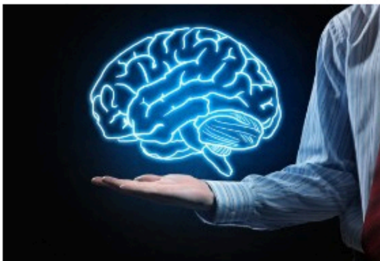
Blood Brain Barrier Organoid reported on by Forbes