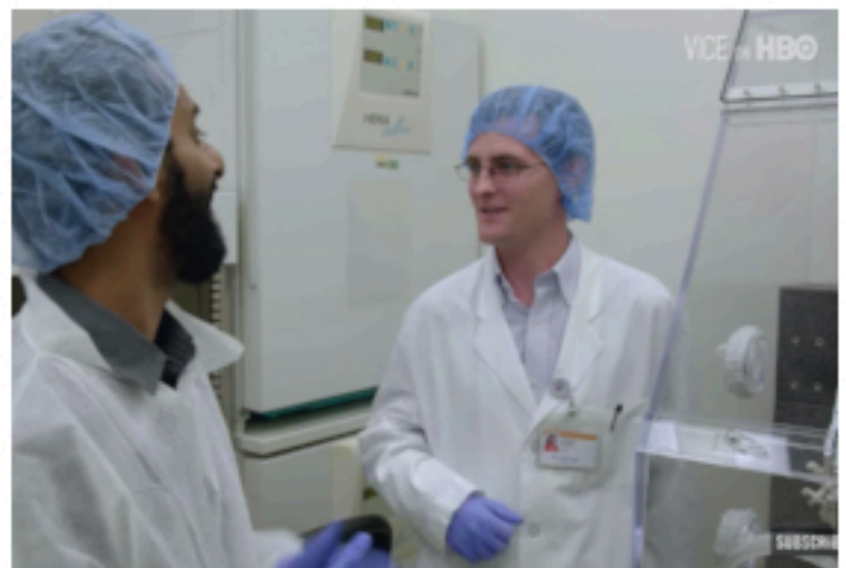
HBO VICE News Explores 3D Printing and Bioprinting in Documentary