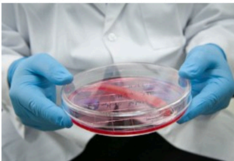
New Regenerative Medicine Concentration Offered at Wake Forest U

We are also excited to announce the new concentration in regenerative medicine that will be offered by the Graduate School of Arts and Sciences at Wake Forest University. We believe this is going to provide a unique educational and research experience for graduate level students.