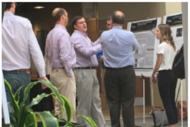
VT-WFU BMES Student Research Symposium Showcases Regen Medicine

Leaders from FDA, NIH, Americans for Cures to Speak at RME