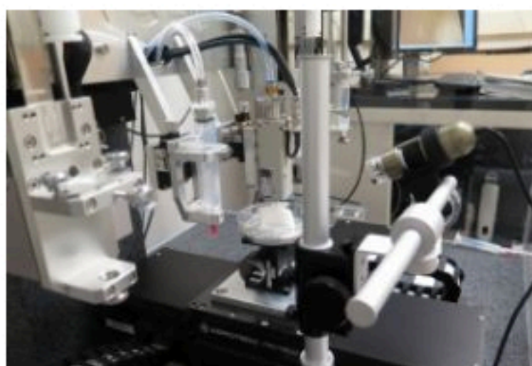
3D Bioprinting Storytelling from The New York Times