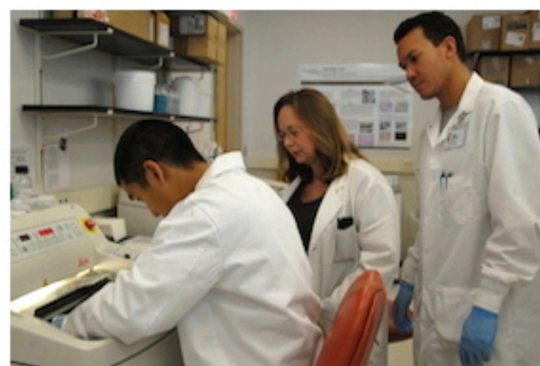
Teacher Externships: Integrating RegenMed into the Classroom