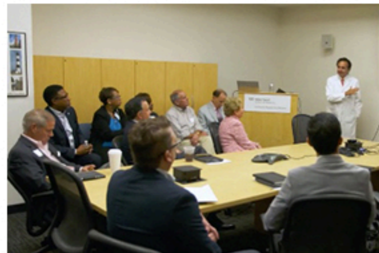
WFIRM Highlighted During Atrium Board Visit