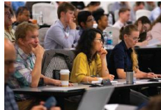
WFIRM sets dates for virtual RME course in June; Early bird registration opens soon

WFIRM research featured in Aerospace America 2021 Year in Review, pg 61