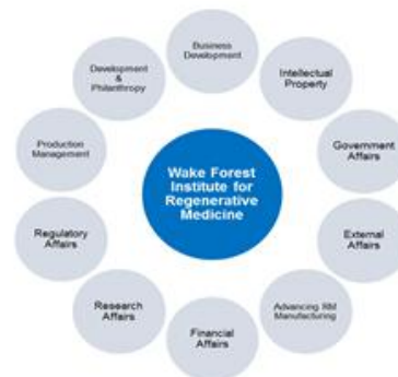
Figure 2: WFIRM Infrastructure enabling STRM Training

Wake Forest Institute for Regenerative Medicine