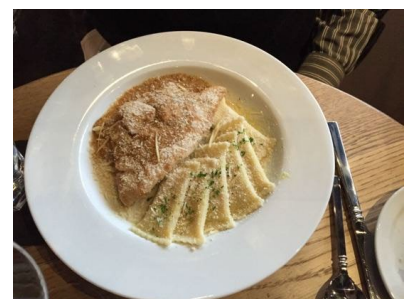
Quanto Basta Chicken Marsala

Quanto Basta - Italian 680 West 4th St., Winston-Salem, NC 336-893-6144