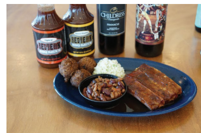
Bibs Downtown BBQ plate

Famous Toastery - Breakfast 770 Liberty View Ct. Winston-Salem, NC 336-306-9023