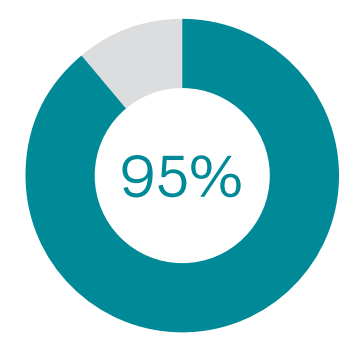
95% of our graduates find a job in their field within 6 months of graduating

Our partnership with Atrium Health means you'll get a clinical education within Atrium Health – one of the nation's most innovative healthcare organizations. Many of our graduates step right into rewarding and stable careers within Atrium Health the moment they graduate. At Carolinas College, discover your true potential both in the classroom and throughout your career.