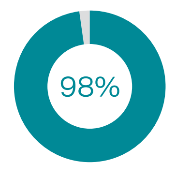
98% of our students pass their licensure or certification exams on the 1st attempt

At Carolinas College, each program is designed to expand minds and open possibilities. Our small school feel and one-on-one faculty support give students access to world-class hospital opportunities at Atrium Health, enabling graduates to consistently achieve licensure and certifications pass rates well above state and national norms. Keep aiming high - we'll help you get there.